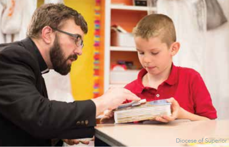
Diocese of Superior