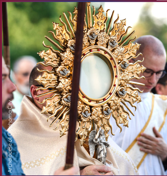
Above: Last year, the Archdiocese of Oklahoma City led more than a thousand faithful Catholics in a two-mile Eucharistic Procession—one of the longest in the country.

As the Church prepares for this historic event, let’s ask our Eucharistic Lord for an outpouring of vocations!